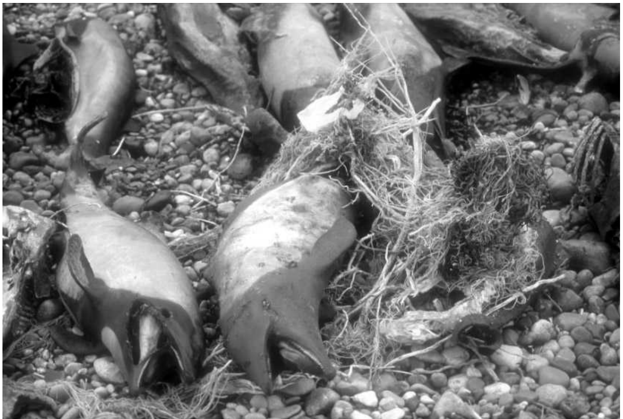
Figure 3. Eleven Commerson's dolphins found dead on La Angelina's beach.