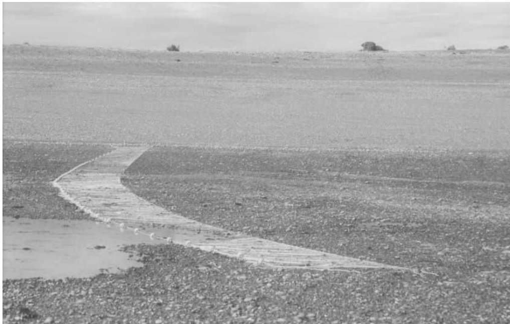
Figure 2. A typical coastal set gill net that is used in the waters of Ría Gallegos and La Angelina for Patagonian blenny and silversides and incidentally catches Commerson's dolphins. Because it is anchored to the ground, this type of net does not fish at low tide (above).

a low, pebbled coast, extending beyond the boundary of Ría Gallegos' city. The sea coast to the south of Punta Loyola and the meridional shore of the river are flat and pebbled, covered with a layer of clay approximately 1m thick. This geological characteristic continues for several kilometres inland (Ría Gallegos and La Angelina - Armada Argentina, 1978). In the Ría Gallegos area, the maximum tidal amplitude is as high as 12m.