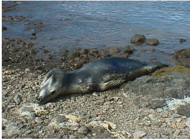
Figure 4. Juvenile leopard seal photographed at Eastern Island on 4 August 2002.

were considered very dangerous at sea. The second individual was a juvenile male of 205 cm body length reported in Vaihu, Eastern Island, on 4 August 2002 (Figure 4). This leopard seal was in poor condition and with multiple injuries to the body, including a deep cut in the tongue, presumably caused by a hook. The specimen was rehabilitated and released on the beach in late August.