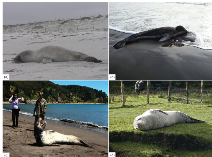
Figure 3. Solitary leopard seals seen at Punta Choros (a), Santo Domingo beach (b), Lengua inlet (c) and Corral Bay (d).

The records of leopard seals in the Central-Northern zone were distributed from 29°13'S (Punta Choros) to 39°55'S (San Juan river), with at least 25 sightings of solitary individuals (Figures 2 and 3). Two of these records correspond to the same individual (sightings N° 19 and 20, Table 1) that was tagged with Rototag numbers 3011 and 3021 in Punta Topocalma (34°10'S) and re-sighted two days later at Algarrobo beach (33°21'S). Only 11 individuals were sexed in this zone, involving six females and five males. Most of the records (52%) occurred between 33-34°S, and 19.2% occurred between 36-37°S. All individuals were juveniles, except for one adult male observed at "Quisco" beach (33°25'S). Sightings were more frequent during winter and spring seasons (n = 23 sightings), particularly in July and August (n = 12 sightings). Regarding body condition, at least five leopard seals were reported to be in poor condition and/or with multiple injuries, and two animals died later (sightings N°14 and 50). One individual (sighting N°11) was found dead on the beach with multiple injuries to the skull. Another two injured individuals (sightings N°12 and 49) were positively treated by the Wildlife Rescue and Rehabilitation Centre of MUCINASA and then released on the beach; one of them remained around the release location for about one month.