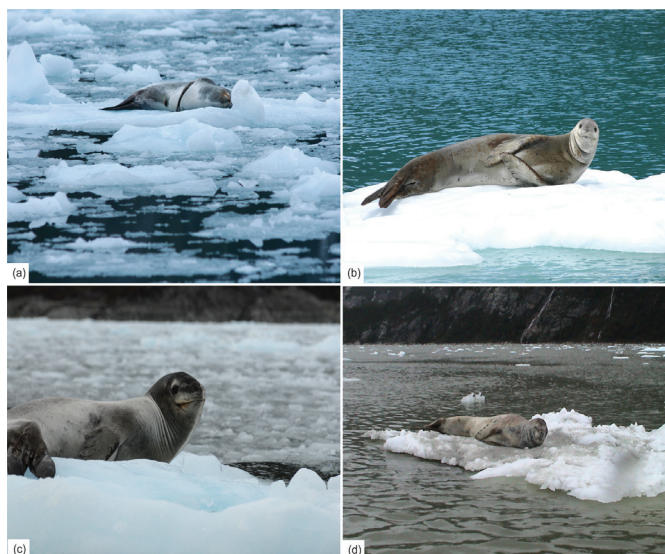
Figure 5. Leopard seals seen at Parry fjord, Almirantazgo Sound (a, b), D’Agostini Sound (c) and Pia Sound, Beagle channel (d).

Almirantazgo Sound (23 sightings - 56 individuals at Parry fjord and 1 sight. - 2 indiv. in Ainsworth Bay); D’Agostini Sound (4 sight. - 9 indiv.); Beagle channel (5 sight. - 8 indiv.); and around the SW coast of Santa Inés Island (Ballena and Helado Sound; 4 sight. - 7 indiv.) (Figure 5). All individuals were recorded resting on ice floes at glacial areas, except for one individual seen at Navarino Island (sighting N°42).